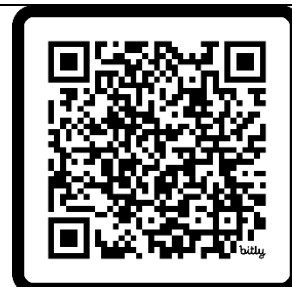
QR 2 Bintang Bali resort Map