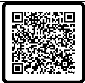
QR 1 Confirmation Form